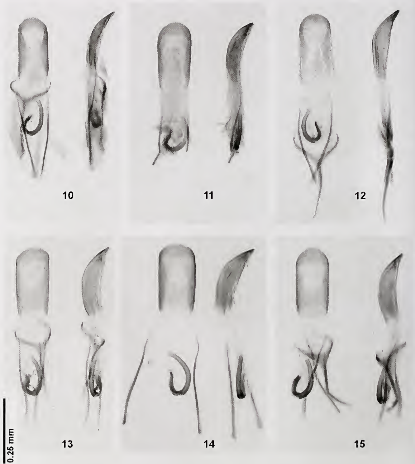
Figs 10-15. Penis dorsal and lateral of Styphlidius spp. (10) S. italicus Osella, 1981 (Aspromonte). (11) S. brevisetis Osella, 1981 (Kefalonia). (12) S. coreyreus (Reitter, 1884) (Kilkis). (13-15) S. pelops sp. nov. (13 Mesohori, 14-15 W Agias Sofia).

Fig. 19. Habitat of Styphlidius pelops sp. nov. near Agias Sofia. The new species was sifted here from leaf litter ( Quercus ilex ) and mosses growing on limestone. ➔